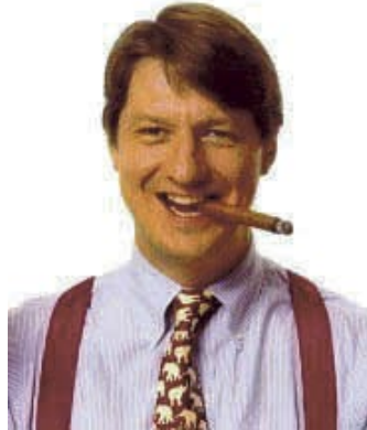
P.J. O’Rourke presents “On the Wealth of Nations” in MANCHESTER CENTER on the 10th.