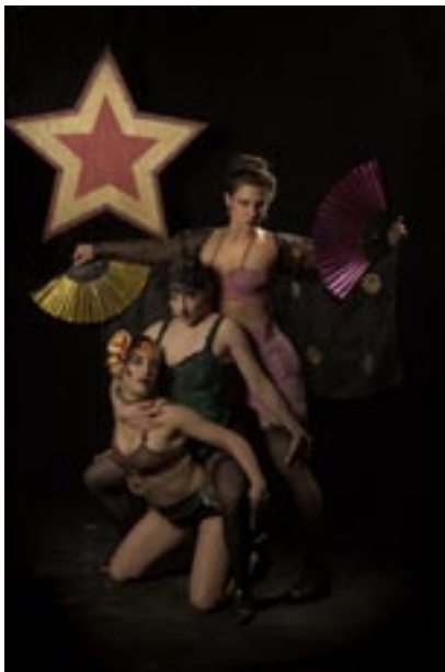
SpielPalast Cabaret starts its run in BURLINGTON on the 11th.